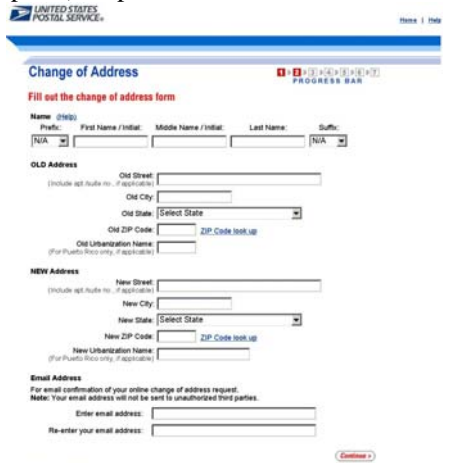
Figure 1: A common layout for service elements A common layout for service elements is shown

(www.firstgov.gov), the UK online service directory (www.direct.gov.uk) and the Singapore egovernment services for citizens catalogue (www.ecitizen.gov.sg). The layout of printed forms has also been considered, since e-services have been found to often mimic the appearance of their paperbased counterparts. The on-line service directories listed above were used as the primary source of services and forms; other sources though were considered as well (e.g. Cyprus' Ministry of Finance (www.mof.gov.cy), Greece's on-line taxation portal (www.taxisnet.gr) as well as EU directives and samples (europa.eu.int/comm/taxation customs)).