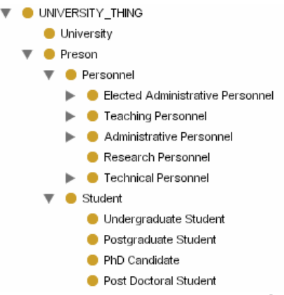
Figure 2. .Part of the ontology in Protégé

The complete ontology evolution was modeled in a single ontology, for the reasons presented in section 3. The ontology was first expanded with two auxiliary classes for time representation, namely Time Instants and Time Periods. Instances of these classes were used to flag the validity periods of classes and instances alike. Figure 2 illustrates a portion of the ontology, as designed in the Protégé tool.